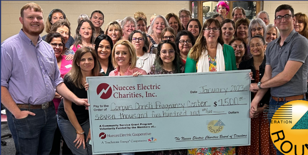
Corpus Christi Pregnancy Center