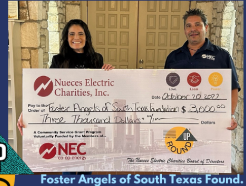
Foster Angels of South Texas Found.

Your membership with Nueces Electric Cooperative has a direct impact in the well-being of local charities and organizations through participation in our Operation Round-Up billing program.